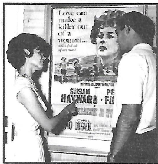
The movie theater at Mercury played current features for a nominal admission.

During the 1960s, the addition of the Plowshare Program and the Nuclear Rocket Development Station, activities involving the use of nuclear energy for peaceful purposes, led to the establishment of the NTS as year-round test site. The results of this increasing activity were evident in Mercury.