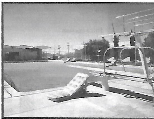
The Olympic-size Mercury swimming pool opened for business in 1964.

One of the larger, most anticipated construction projects was the Mercury Cafeteria and Steakhouse. Food facilities consultants studied the special feeding problems and overcrowding at Mercury mess halls and worked with the architect/engineer to design the new cafeteria's kitchen and serving areas. Trays used in the new cafeteria had a modified triangle shape so that four trays would fit on one table, a design that is still used in the cafeteria today. The cafeteria combined style with function: the perforated block wall was not used just for aesthetics - the wall assists in the heating and cooling of the cafeteria. Upon its completion, the new cafeteria had a total seating capacity of 800, and a steakhouse to provide a more elegant dining experience.