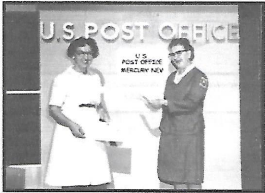
The Mercury Post Office on opening day, October 1964.

Mercury, Nevada, a town 65 miles northwest of Las Vegas, is the gateway to the Nevada Test Site (NTS). There is no evidence as to how Mercury was named, but legend says that an unknown miner worked in the Calico Hills in the 1850s mining mercury-bearing ore. His route of travel became known as the Mercury Road, and the area surrounding it became known as Mercury.